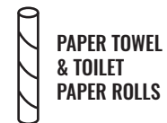
PAPER TOWEL & TOILET PAPER ROLLS