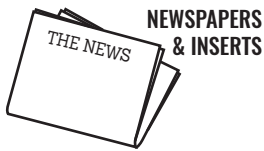
NEWSPAPERS & INSERTS