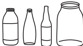
ALL BOTTLES & JARS