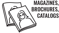
MAGAZINES, BROCHURES, CATALOGS