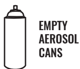
EMPTY AEROSOL CANS