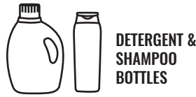
DETERGENT & SHAMPOO BOTTLES