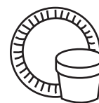
WAXED PAPER PLATES, CUPS & TAKEOUT CONTAINERS