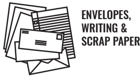
ENVELOPES, WRITING & SCRAP PAPER