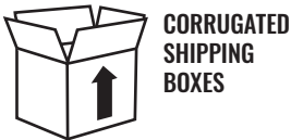
CORRUGATED SHIPPING BOXES