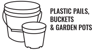
PLASTIC PAILS, BUCKETS & GARDEN POTS