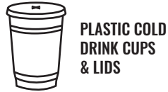
PLASTIC COLD DRINK CUPS & LIDS