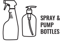
SPRAY & PUMP BOTTLES