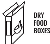
DRY FOOD BOXES