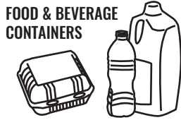
FOOD & BEVERAGE CONTAINERS