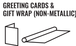
GREETING CARDS & GIFT WRAP (NON-METALLIC)